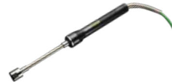
1 x Surface temperature probe