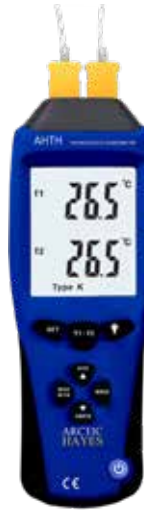
1 x Differential thermometer dual input