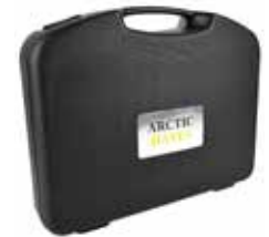
1 x Robust Case & Batteries included