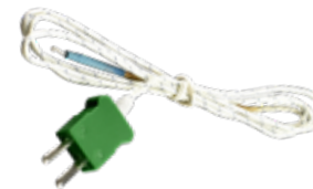
2 x 1M K-Type thermocouple wires