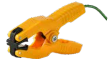
2 x Pipe clamp temperature probes