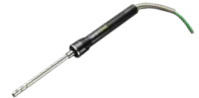
1 x Air & liquid temperature probe